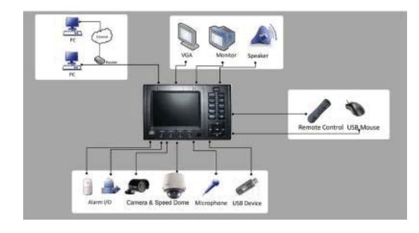
Rear Panel of DS-7204HVI-ST/L